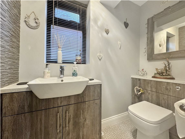
Ground Floor Wc

With a window to the side aspect, fitted with a low level w/c and an inset with wash basin set on a a Granite worktop, wtih storage under. Radiator.